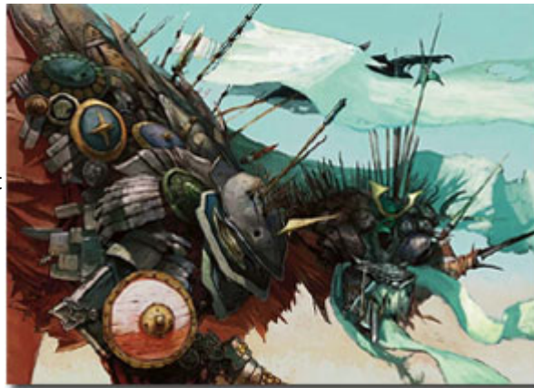
War Elemental, art by Anthony S. Waters

War Elemental is a very red creature. Just look at its mana cost! Red, red, red. And it thrives on damage. Heck, it dies without damage! But I already devoted a deck to it once, so I was reluctant to revisit it. Then, like a bolt from the blue—er, red—the War Elemental + Ion Storm combo hit me. Pay \{1\} and remove one +1/+1 counter from War Elemental, and Ion Storm deals 2 damage to your opponent... which puts two +1/+1 counters on War Elemental. Hmm, that seems repeatable. Special bonus backup artifact that works much the same way: Talon of Pain.